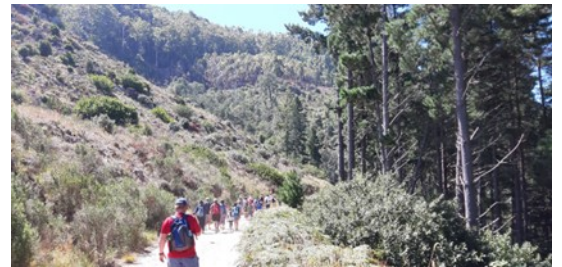
Cecilia forest hike