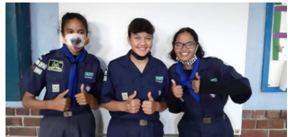
the C.I's (Cub instructors)