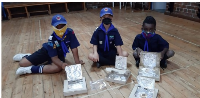
Solar cookers - National challenge